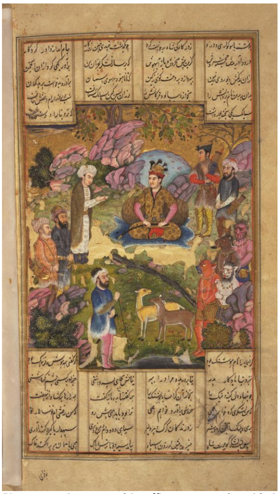
Keyumars instructs his officers to combat Ahriman: this is how the preaching of all the prophets in encapsulated in one symbolic representation. Spirituality does not need volumes of otherwise useless treatises to set the norms and convey the truth about Life.

impotent, unconscious and spiritually disconnected human being to another person that gets criminally powered at both, the spiritual and the material, levels, therefore resulting in impermissible and lawless exploitation.