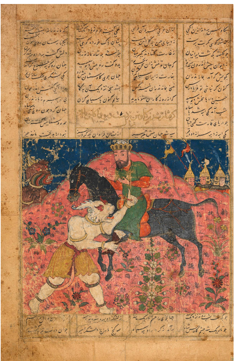
The fall of Mankind is symbolized within the context of Islamic mysticism by Kay Kavus, the second king of the Kayanian dynasty; in this miniature, Kay Kavus (son of the sublime Kay Kawad (or Kay Qubad), father of the misfortunate Siyavash (or Siyavush), and grandfather of

alteration of the earlier form of religion, rendering some narratives 'incredible' or 'inexplicable', due to the proliferation of the idiotic rationalism of the fallen humans. Then, the worthless believers accepted the 'unbelievable' stories blindly, further worsening their condition of grave faithlessness (without of course realizing the calamitous situation in which they found themselves).