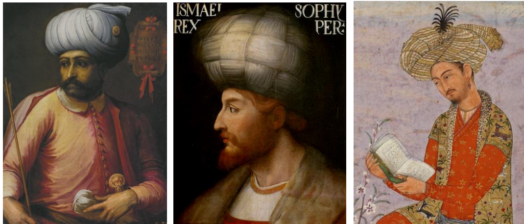
Selim I, Ismail I Safavi, and Babur

Certainly, the Safavid Empire was not the first Islamic state established by a mystical order; but earlier states launched by mystical orders were either set up in small and remote territories as form of local resistance against the Islamic Caliphate like the Babakiyah (Khurramites) or organized as a secret subversive movement coordinated from mysterious, faraway, unreachable and impregnable headquarters, like those of the Hashashin Isma'ilis (known as Assassins in Western literature). In this regard, at the level of governance, the main difference between the Safavids and the Isma'ilis was the fact that the latter did not try or even plan to proclaim an empire, whereas the former, even before solemnly announcing their empire, felt that they had the task to entirely reshape the Islamic world.