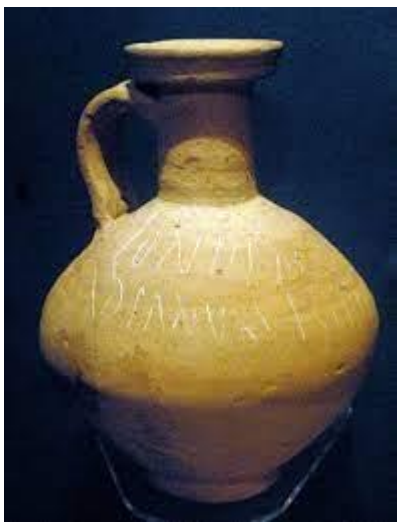
LONDINI AD FANVM ISIDIS (To London at the temple of Isis)

It is yet in this period that the radiation of the Ancient Egyptian civilization eclipsed that of all the other main lands of civilization (Aramaean Mesopotamia, Iran, Turan, India, and Berber North Africa), as numerous Egyptian cults, mysticisms, systems of world conceptualization, Cosmology, Cosmogony, Eschatology and Soteriology, mythological symbols, spiritual and material sciences properly speaking flooded the Roman Empire, Greece, Rome and even Europe outside the imperial borders. Greeks, Macedonians, Illyrians, Dacians, Panonians, Romans, Germans, Celts and many other nations in Britain and Spain believed Isis, Horus, Osiris, Anubis, Thot, Maat, and many other elements of the Ancient Egyptian Transcendental Wisdom and Spirituality – and yet no Egyptian schoolchildren learn about this fact.